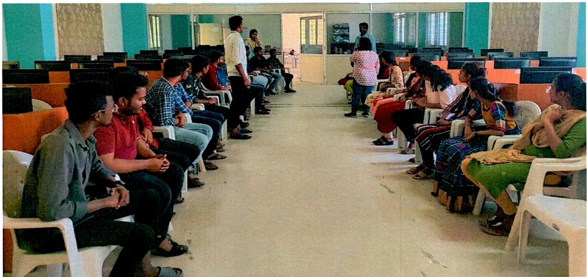
DEBATE ON GENDER EQUITY (Gender equity is the process of being fair to women and men).

DIRECTOR-IC Brilliant Grammar School Educational Society's Group of Institutions (7Q) Abdullapurmet (M), R.R. Dist. Hyderabad