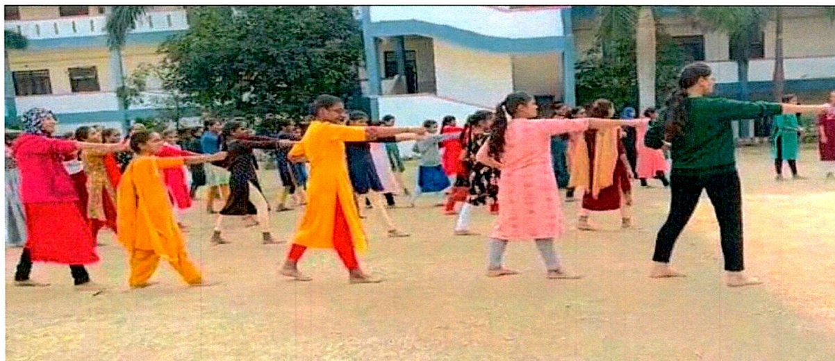
Self-Defense and Karate performed by BRIG girls